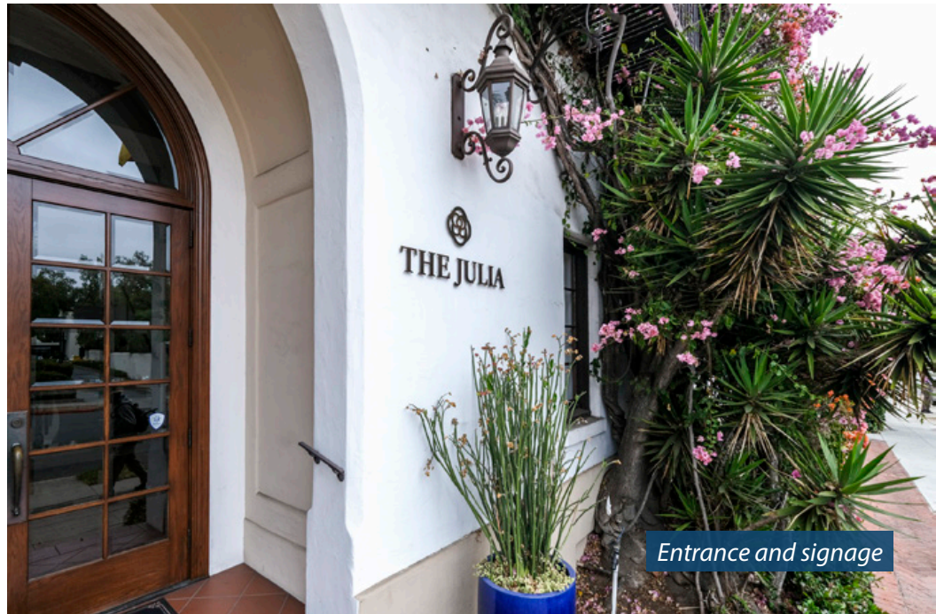
Entrance and signage