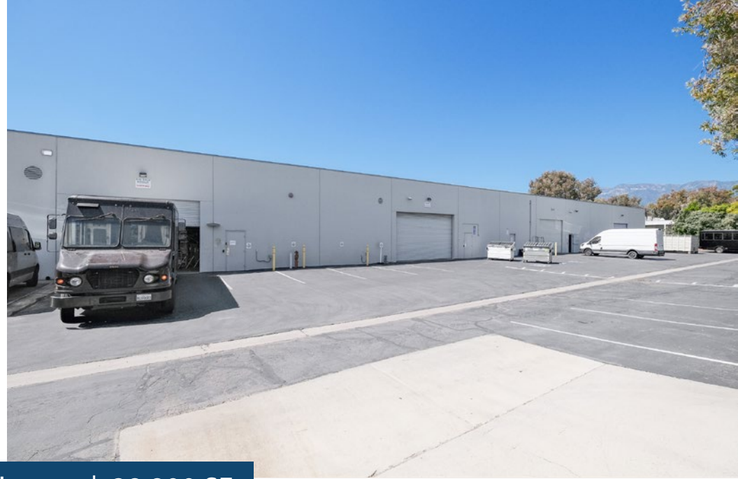
Building C | Warehouse | 28,800 SF