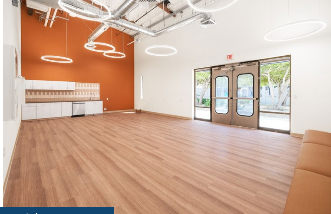
Building B | Industrial | 28,800 SF