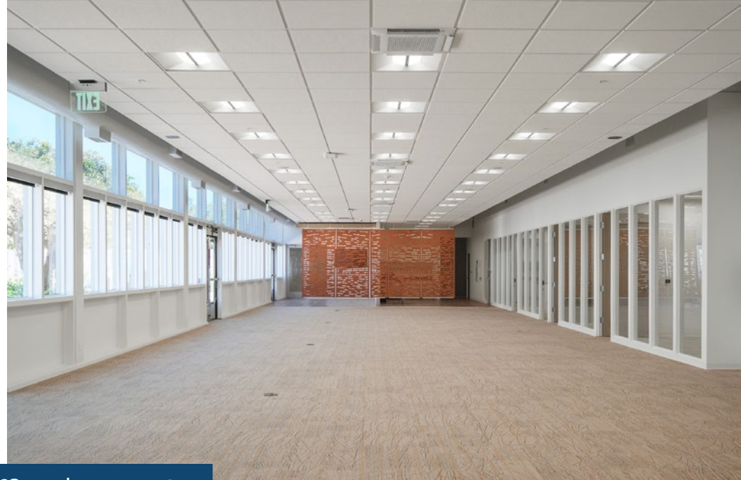
Building A | Office | 5,600 SF