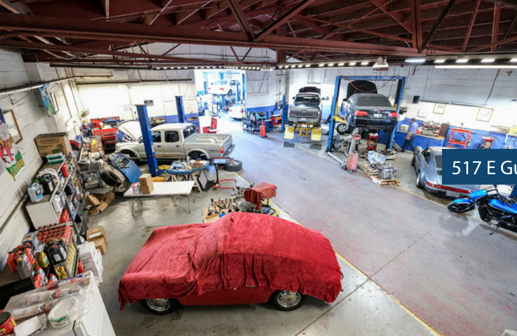
517 E Gutierrez St