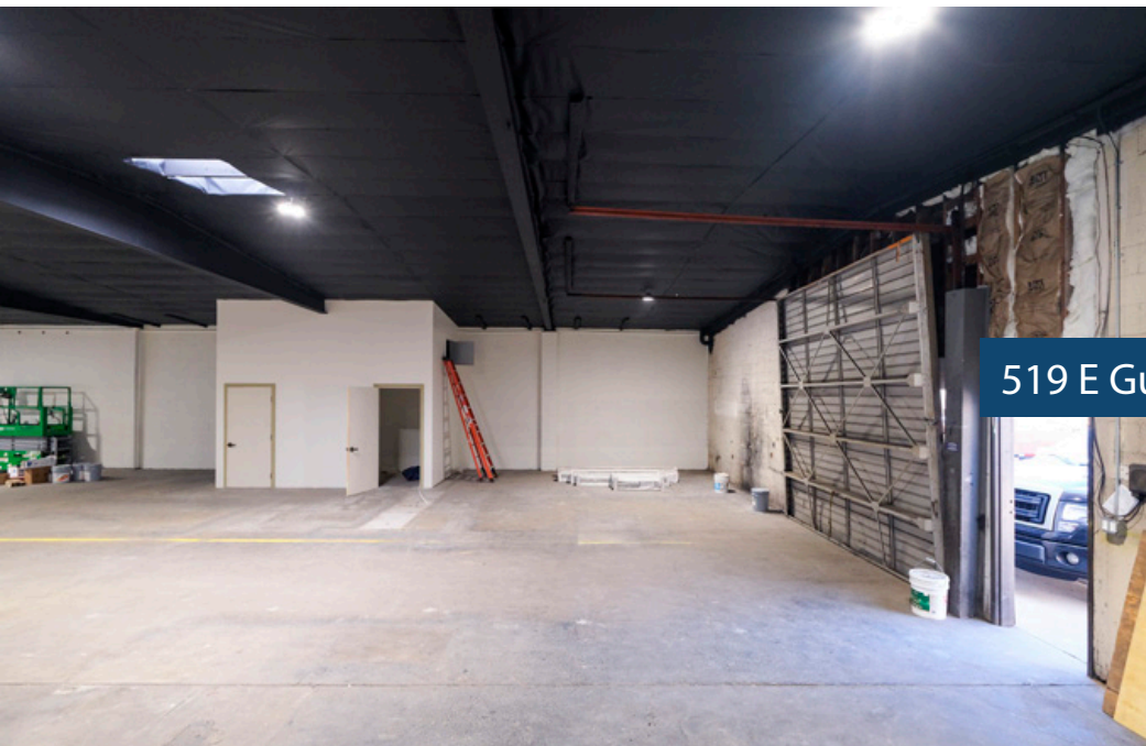
519 E Gutierrez St