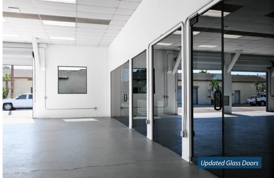
Updated Glass Doors