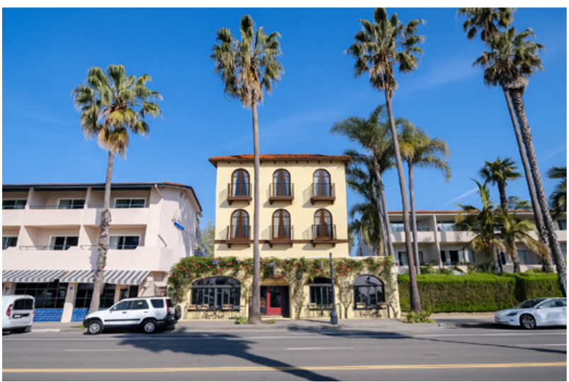
Property photo modified by AI to illustrate potential hotel development.

The property features a single-tenant, NNN lease restaurant, providing a stable investment opportunity with minimal landlord responsibilities.