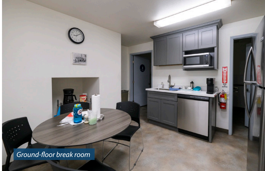
Ground-floor break room