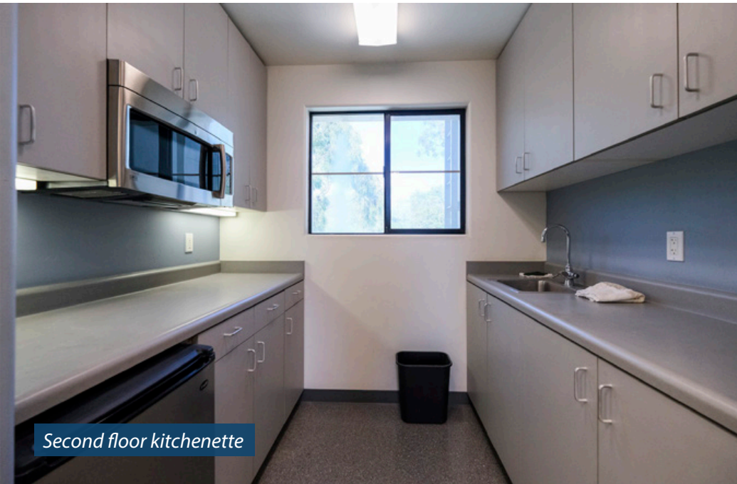
Second floor kitchenette