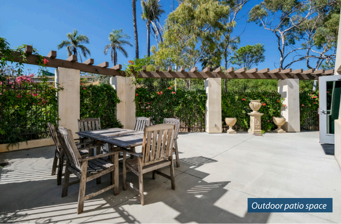
Outdoor patio space