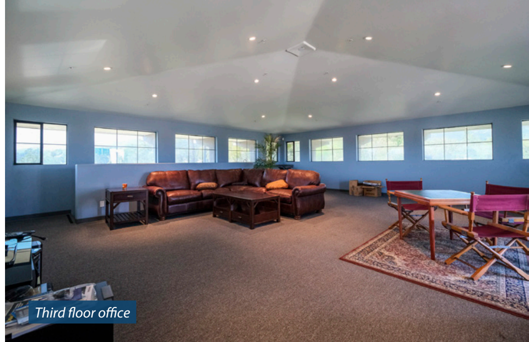
Third floor office