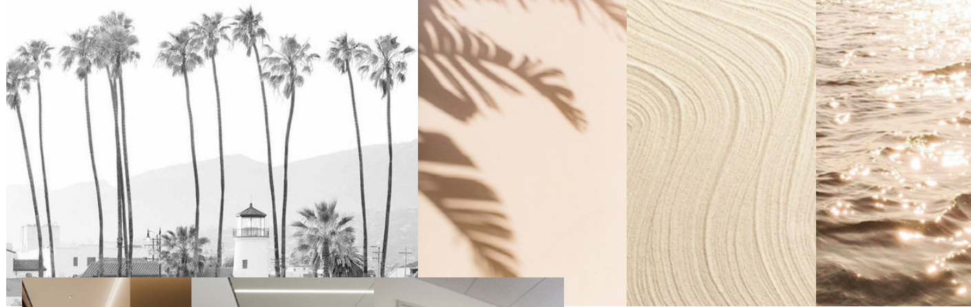
DESIGN CONCEPT IMAGERY

The renovation at 201 N Calle Cesar Chavez will include design elements similar to the ones found on this page. This aesthetic combines universal sophistication with a welcoming atmosphere. It features modern elements and warm, inviting natural materials, while drawing inspiration from the historical Spanish architecture and unique charm of Santa Barbara.