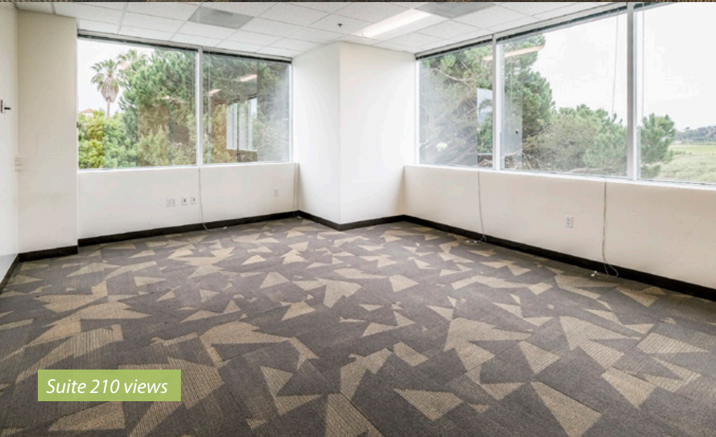
Suite 210 views