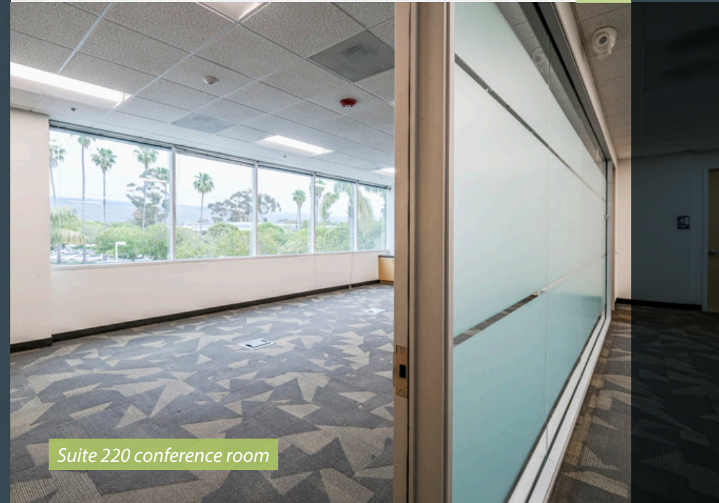
Suite 220 conference room

The project is situated in a core location along Goleta's tech corridor, with easy access to Hwy 101, UCSB, and Santa Barbara Airport.