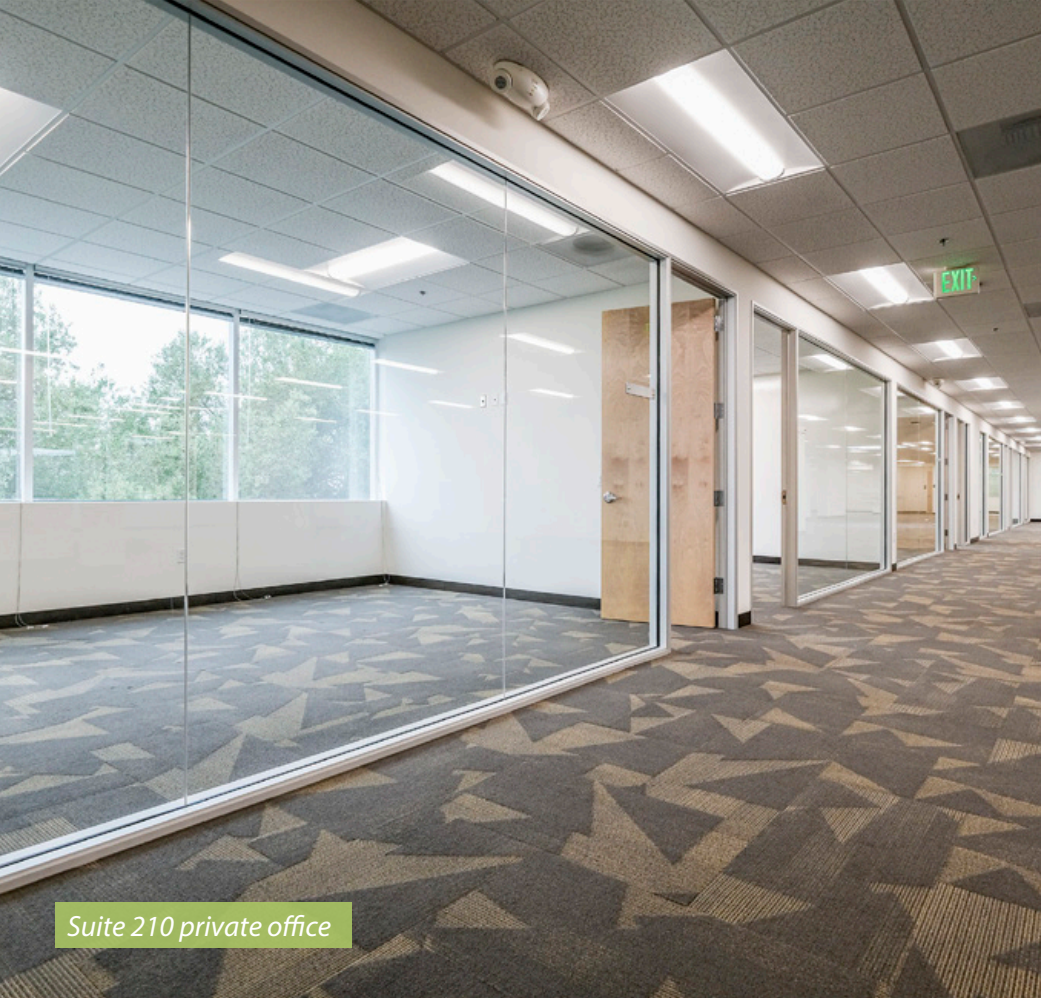
Suite 210 private office

Goleta is distinctive due to its location between Silicon Valley and Los Angeles as well as proximity to a top-tier STEM research university (UCSB). It has become known as “Techoptia” with numerous tech companies relocating to Goleta over the past several years. Goleta caters to tenants requiring office, industrial, bioscience lab or research & development uses (“Flex Buildings”). Goleta offers quality housing, sought-after beach location, and an excellent lifestyle, coupled with great weather year-round. Flex Buildings have been desirable for many years and are attracting increased demand for the long term due to their various uses. Majestic currently owns 19 Flex Buildings in Goleta.