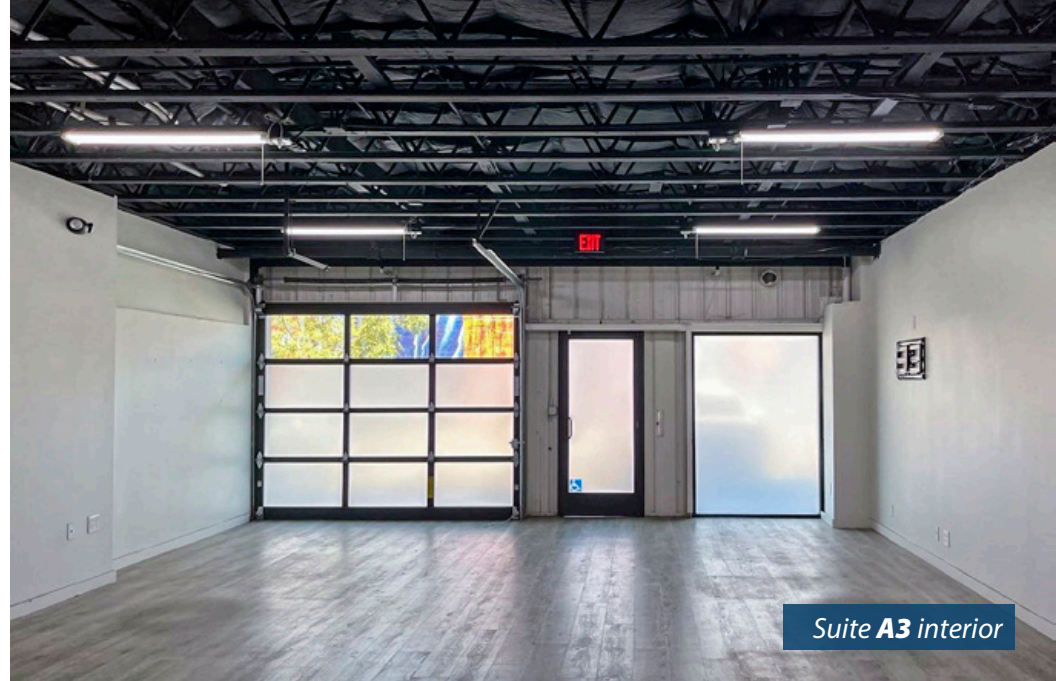
Suite A3 interior