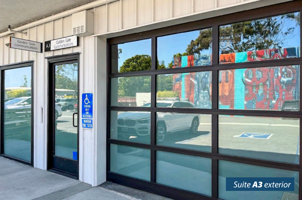
Suite A3 exterior