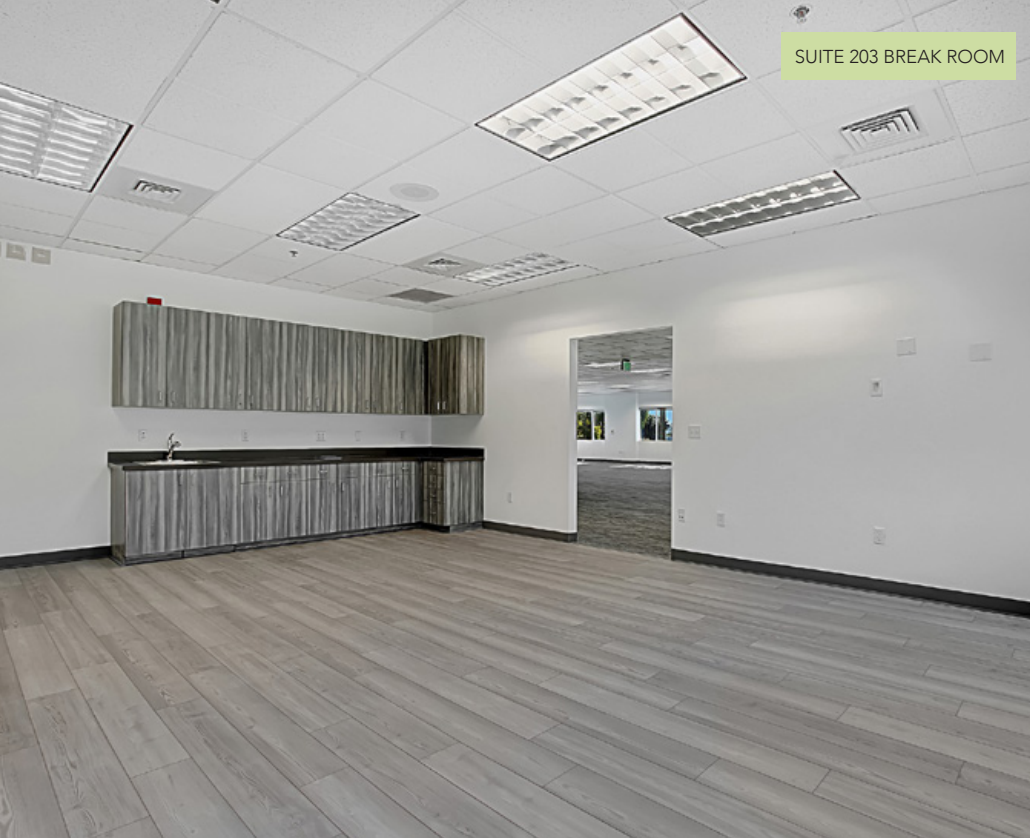
SUITE 203 BREAK ROOM