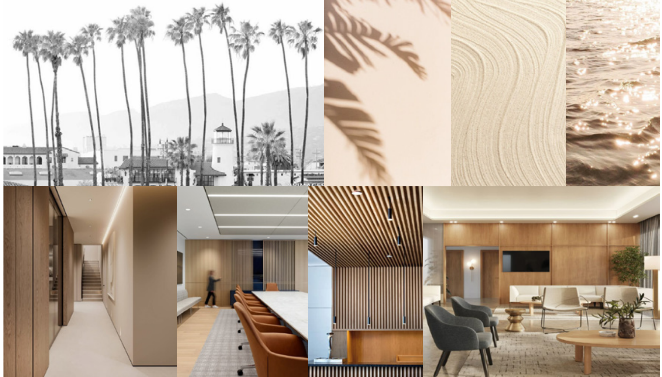
DESIGN CONCEPT IMAGERY

The major renovation at 1014 Santa Barbara Street will include the design elements on this page, employed in the style of the reference images at right. This aesthetic combines universal sophistication with a welcoming atmosphere. It features modern elements and warm, inviting natural materials, while drawing inspiration from the historical Spanish architecture and unique charm of Santa Barbara.