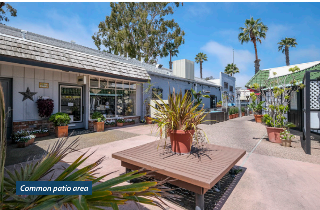
Common patio area