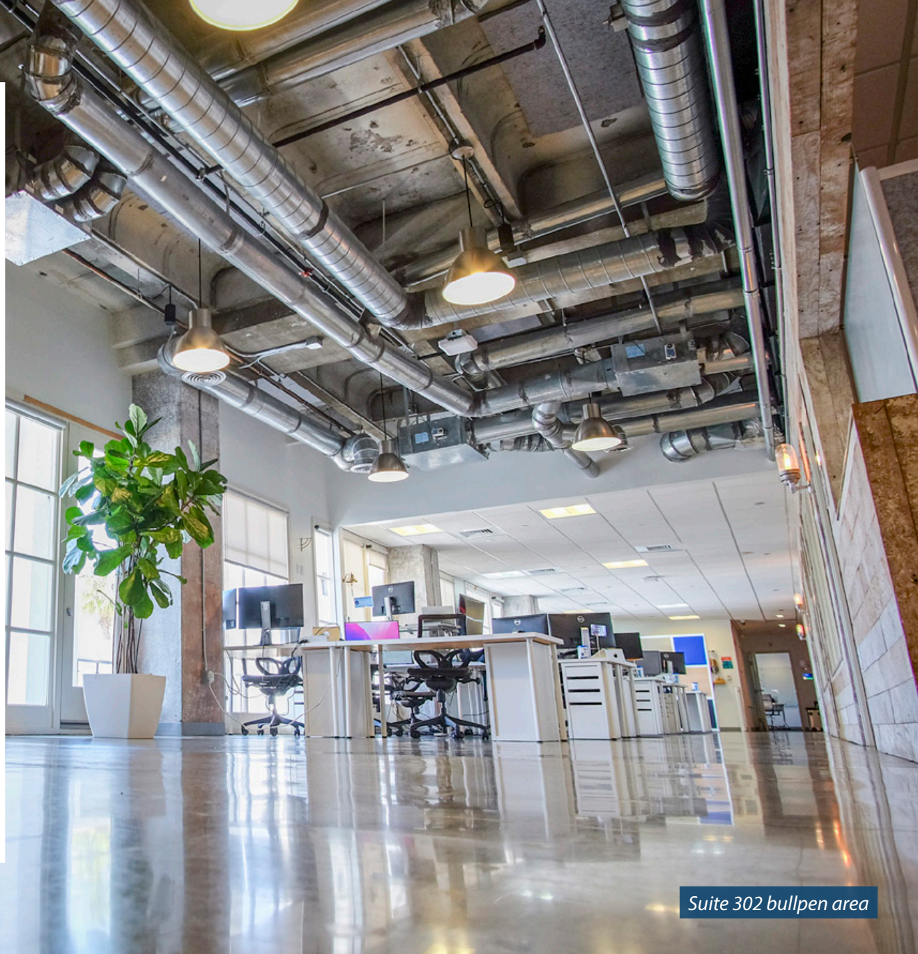
Suite 302 bullpen area

Experience. Integrity. Trust. Since 1993