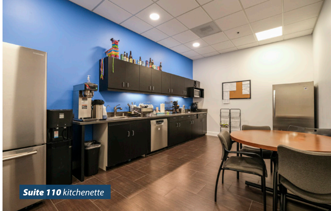
Suite 110 kitchenette