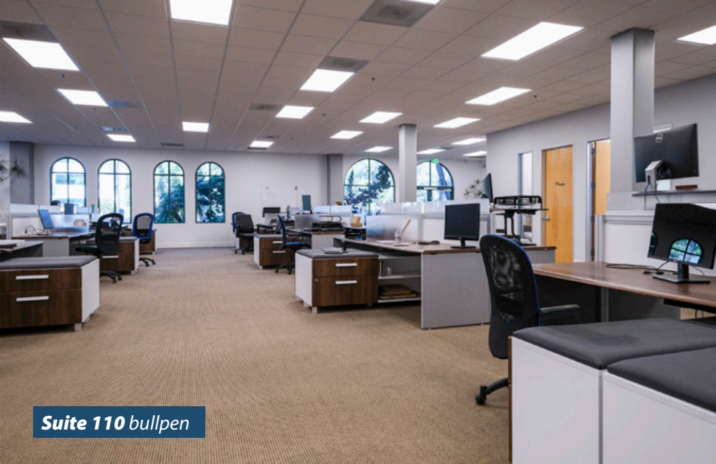
Suite 110 bullpen