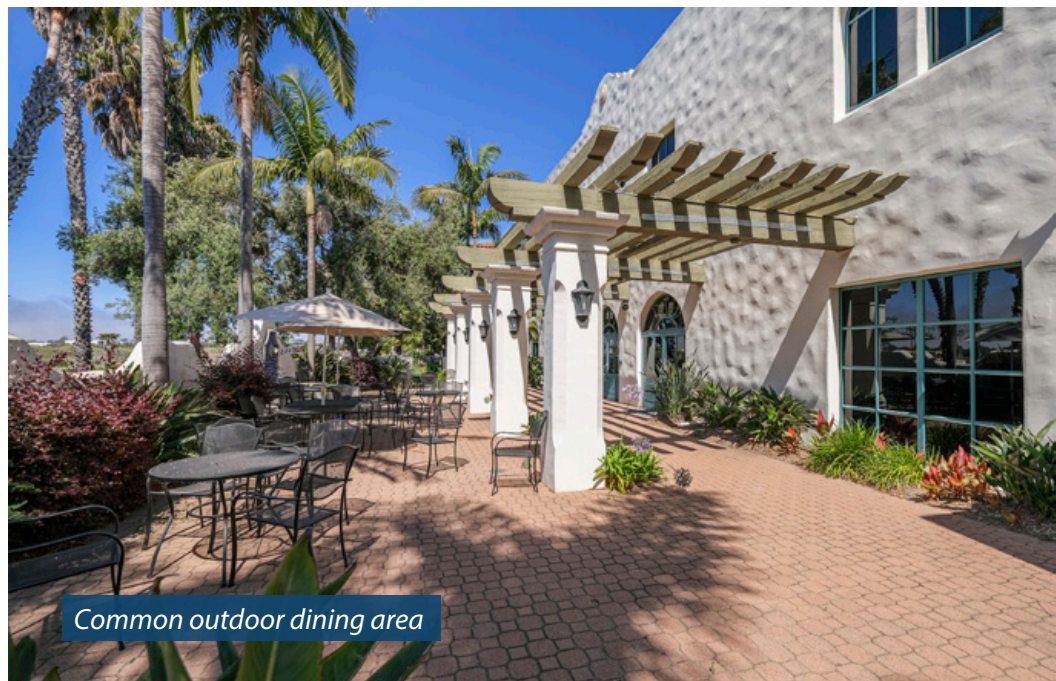
Common outdoor dining area

Experience. Integrity. Trust. Since 1993