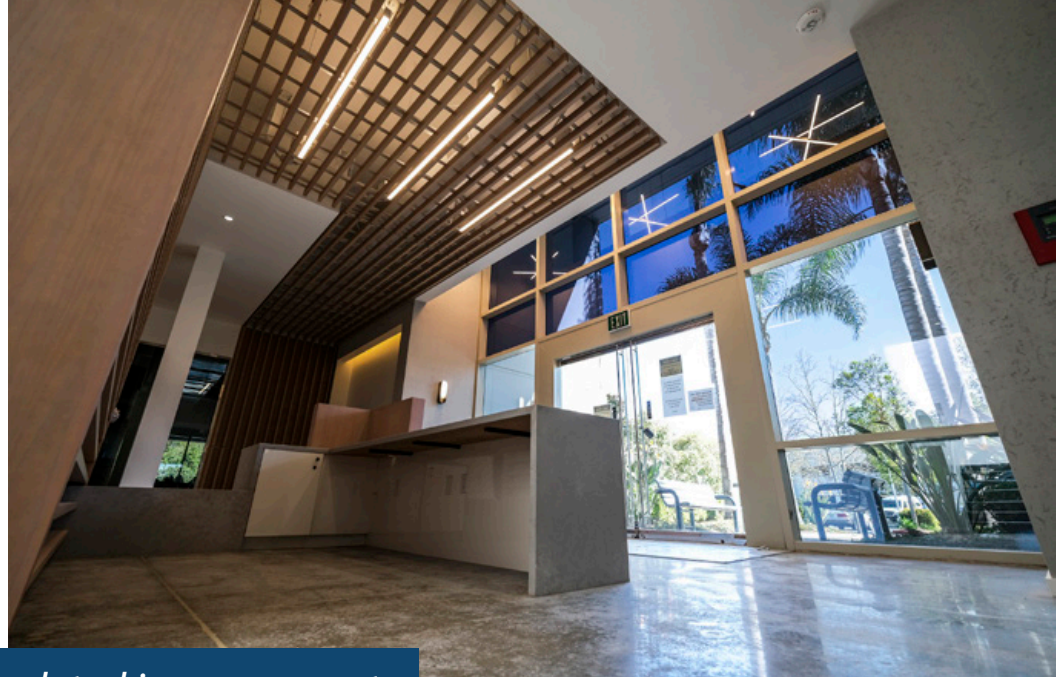
Photos of recently completed improvements