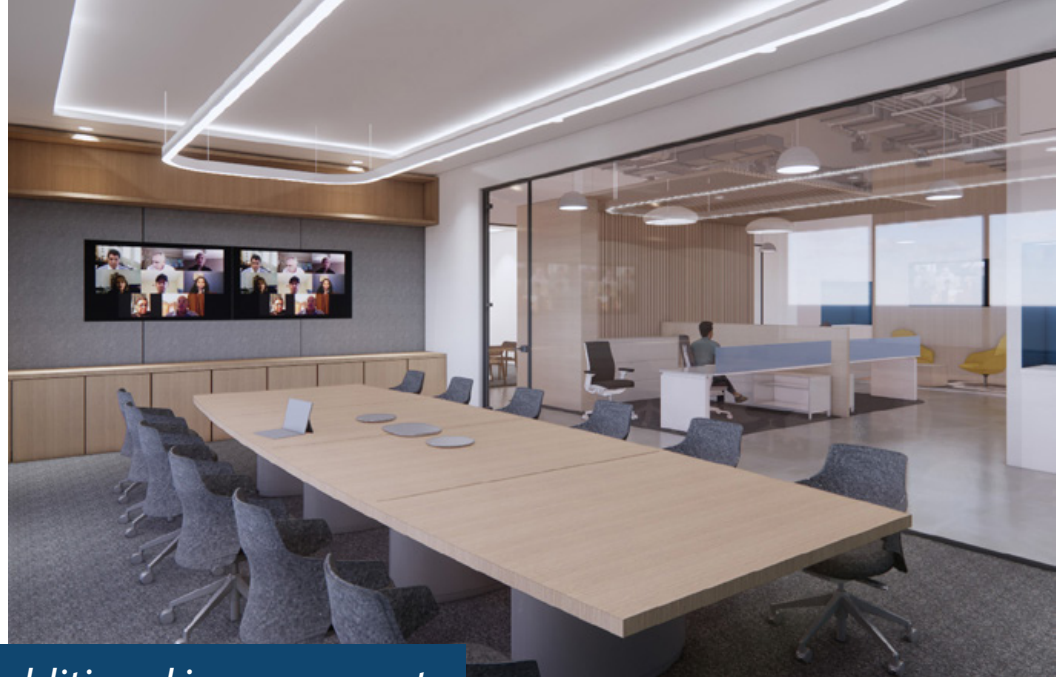
Renderings of potential additional improvements