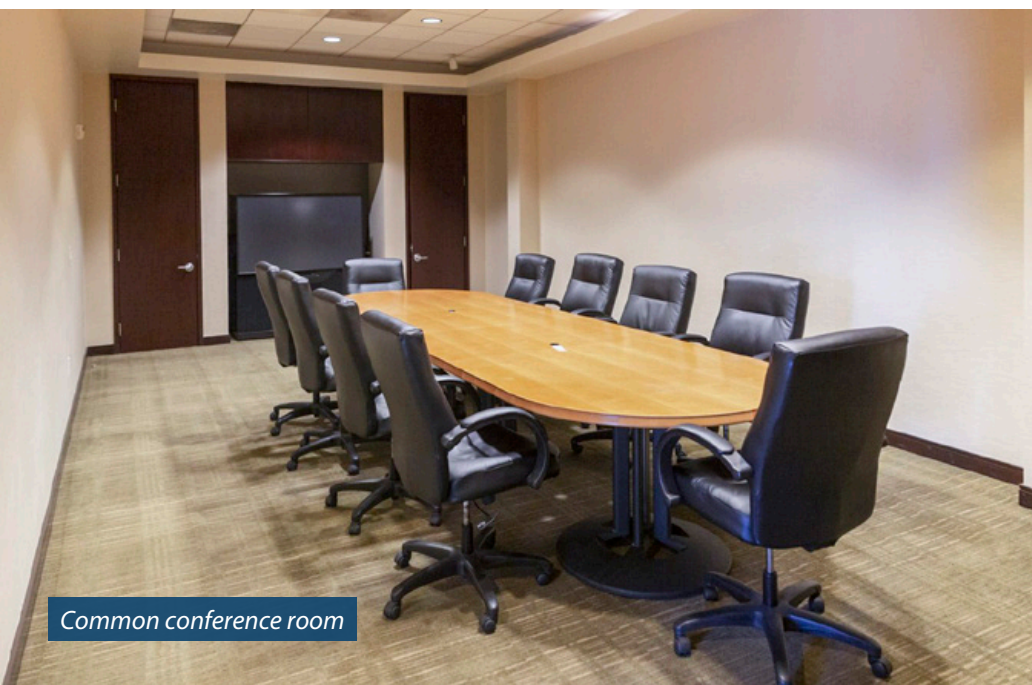
Common conference room