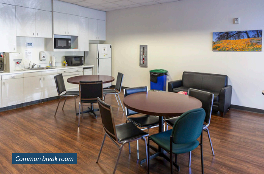
Common break room