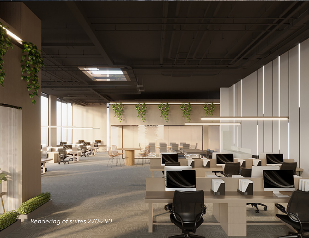
Rendering of suites 270-290