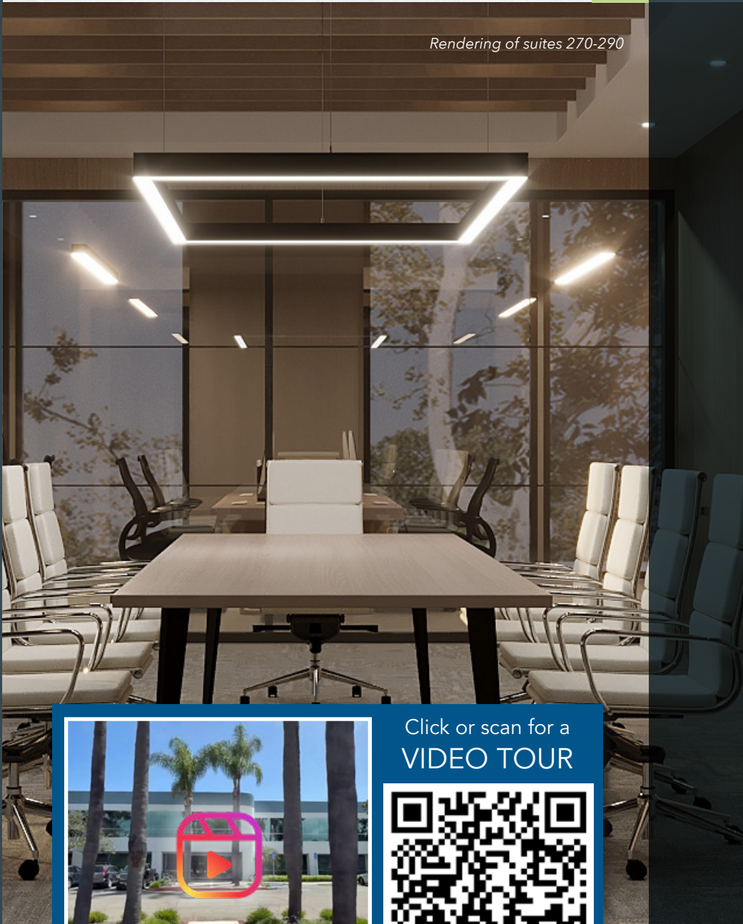
Rendering of suites 270-290