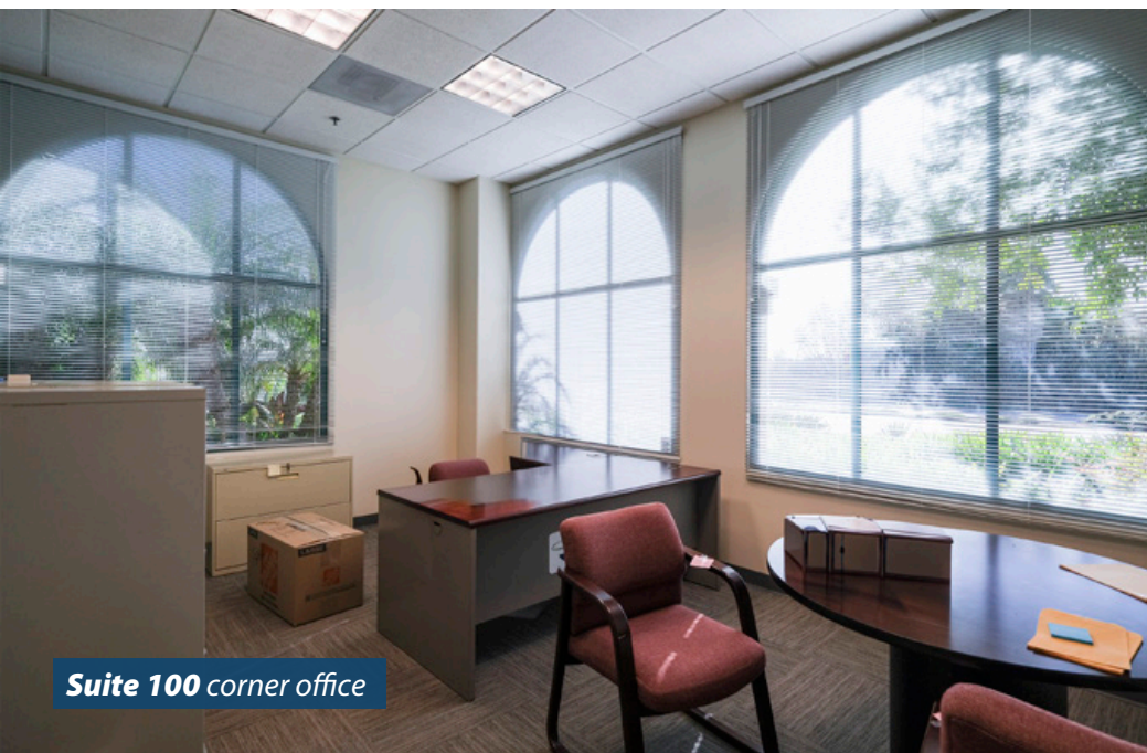
Suite 100 corner office