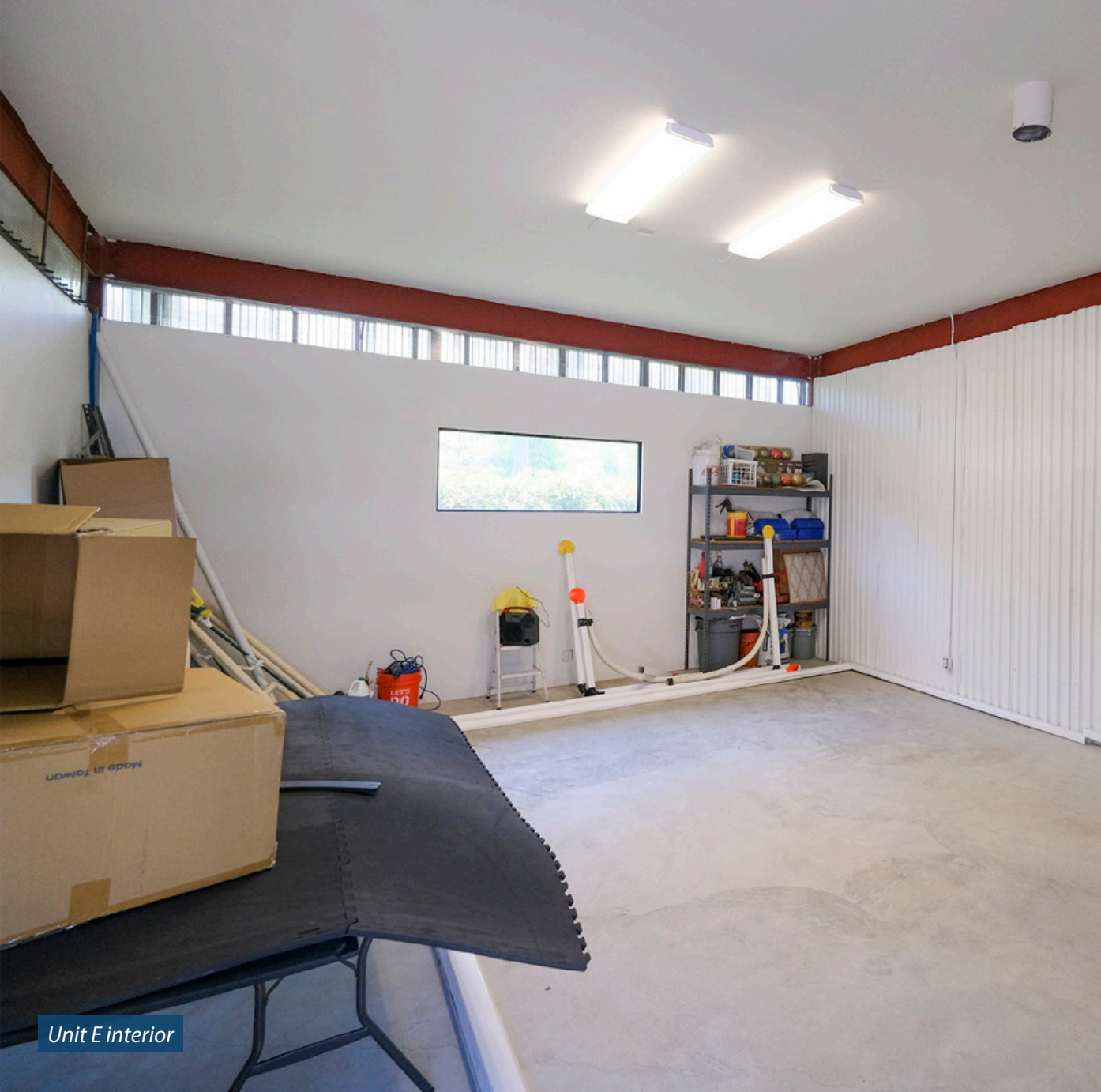
Unit E interior