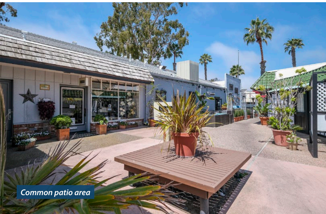
Common patio area