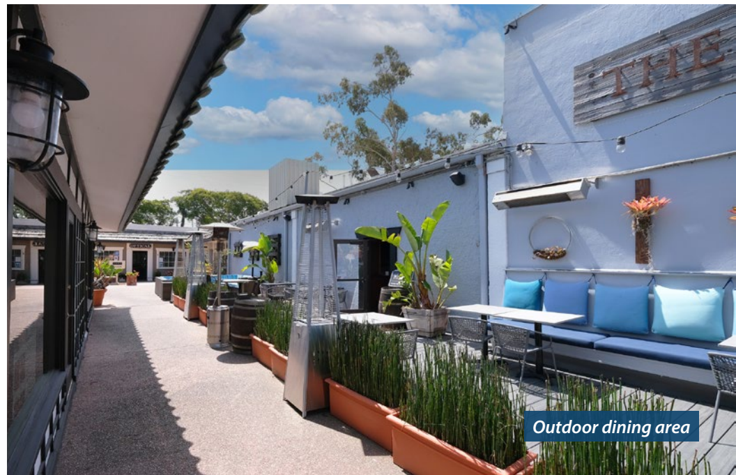
Outdoor dining area

Experience. Integrity. Trust. Since 1993