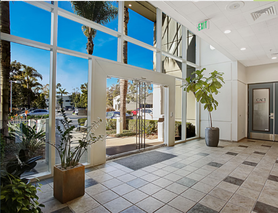
TECH PARK @ CASTILIAN