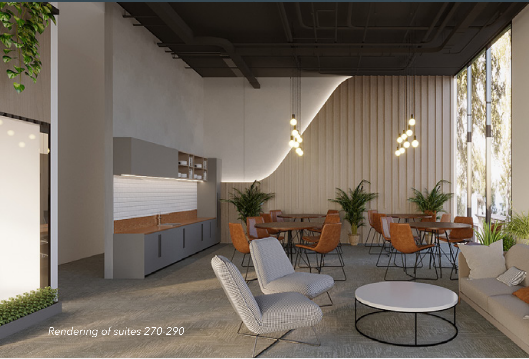
Rendering of suites 270-290