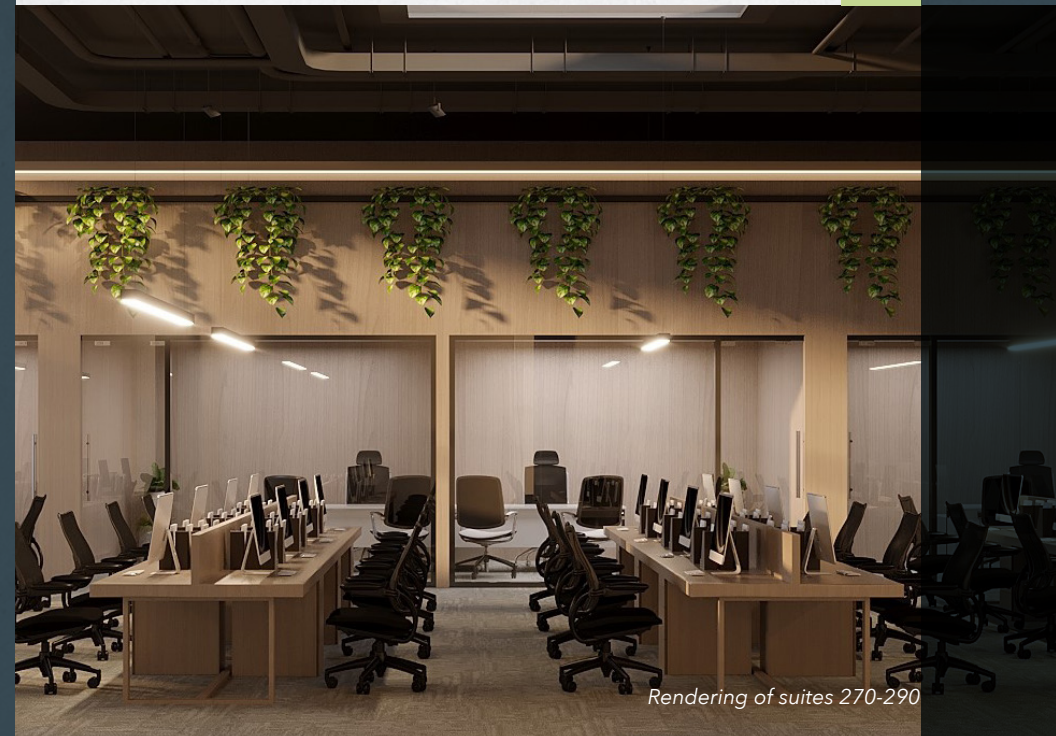
Rendering of suites 270-290

The project is situated in a core location along Goleta's tech corridor, with easy access to Hwy 101, UCSB, and Santa Barbara Airport.