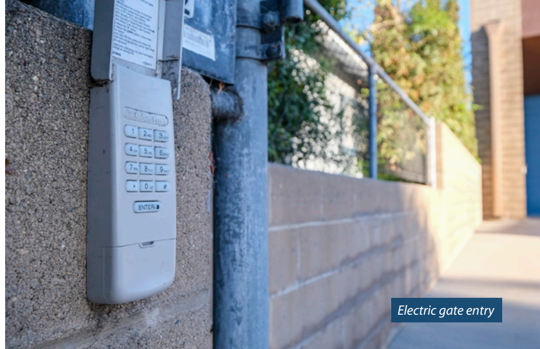
Electric gate entry