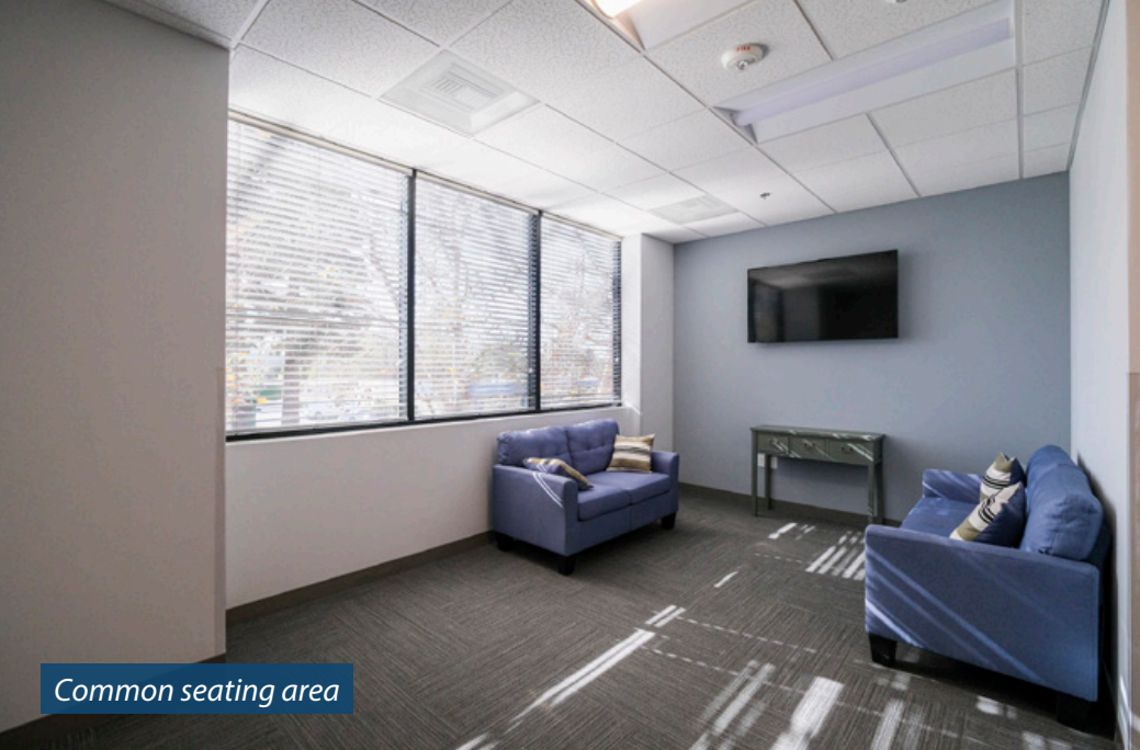
Common seating area