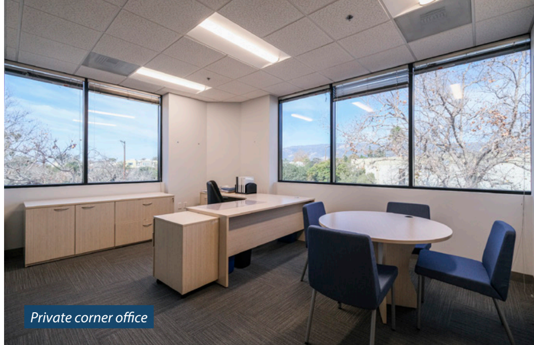
Private corner office