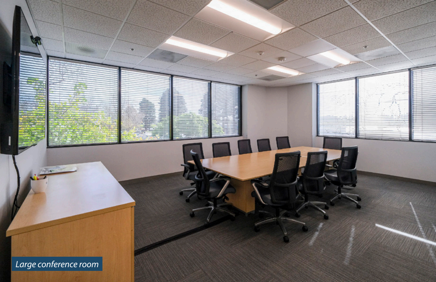
Large conference room