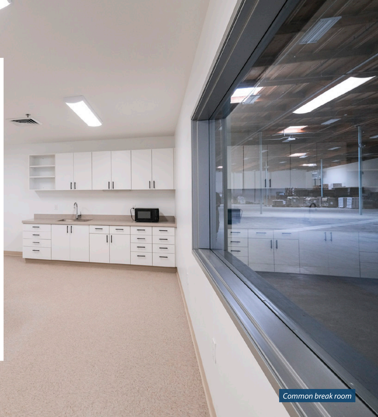
Common break room

Experience. Integrity. Trust. Since 1993