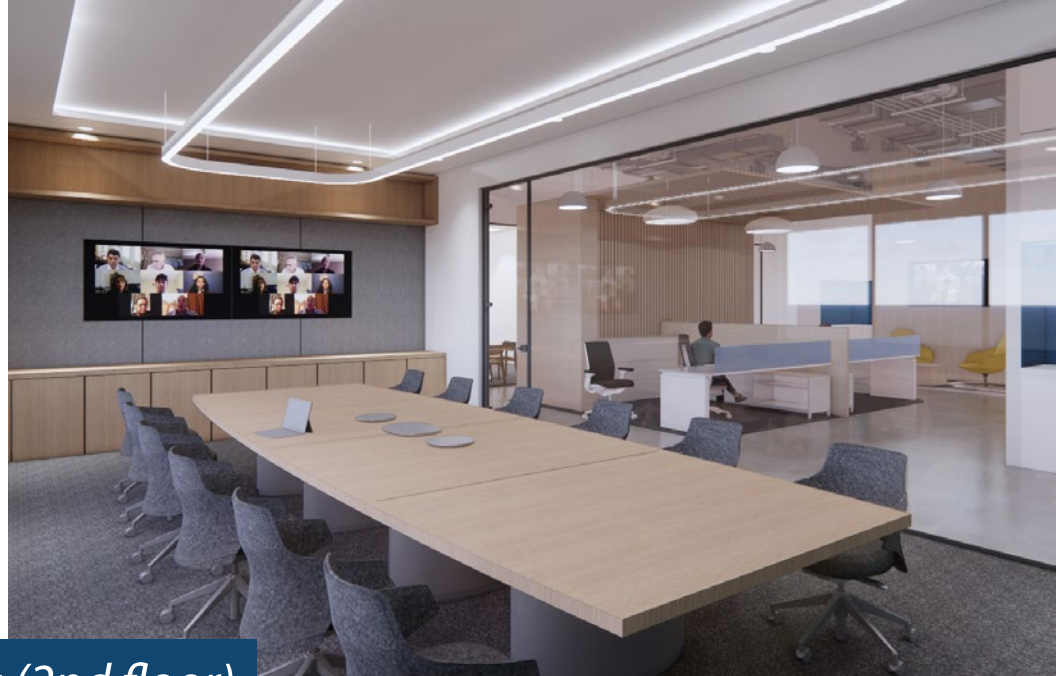
Renderings (2nd floor)