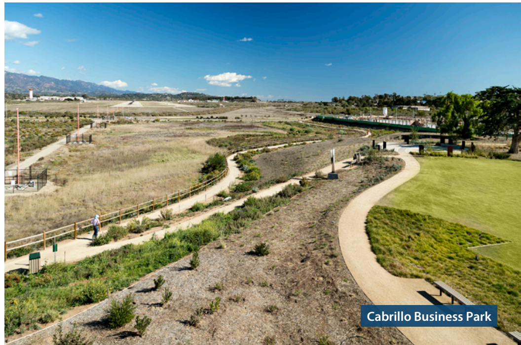
Cabrillo Business Park

Experience. Integrity. Trust. Since 1993