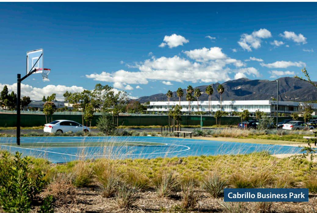
Cabrillo Business Park