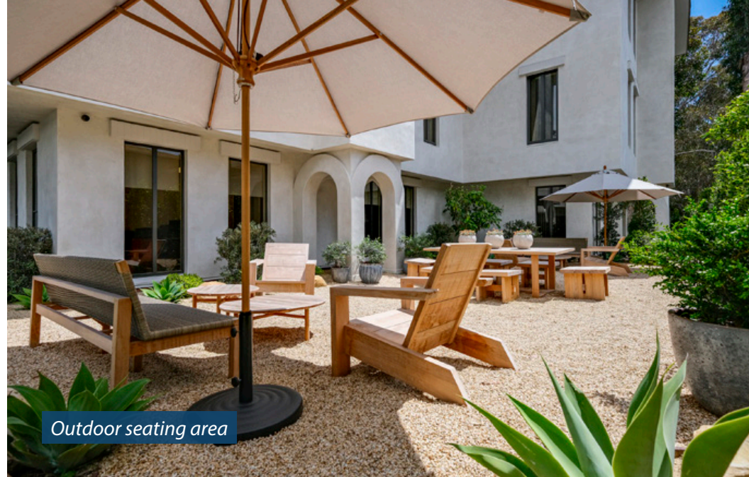
Outdoor seating area