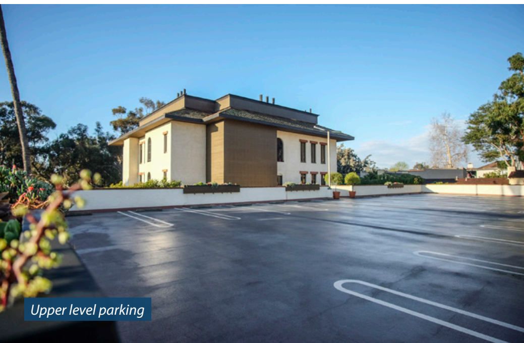
Upper level parking