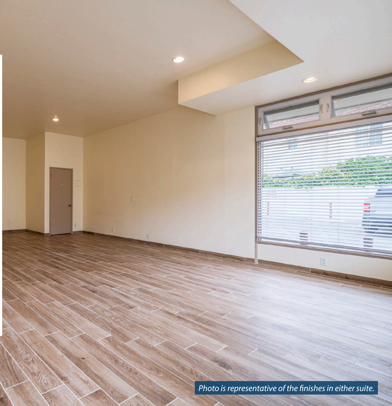
Photo is representative of the finishes in either suite.

Experience. Integrity. Trust. Since 1993