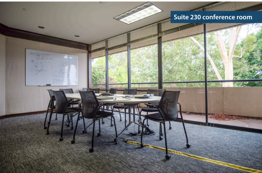
Suite 230 conference room