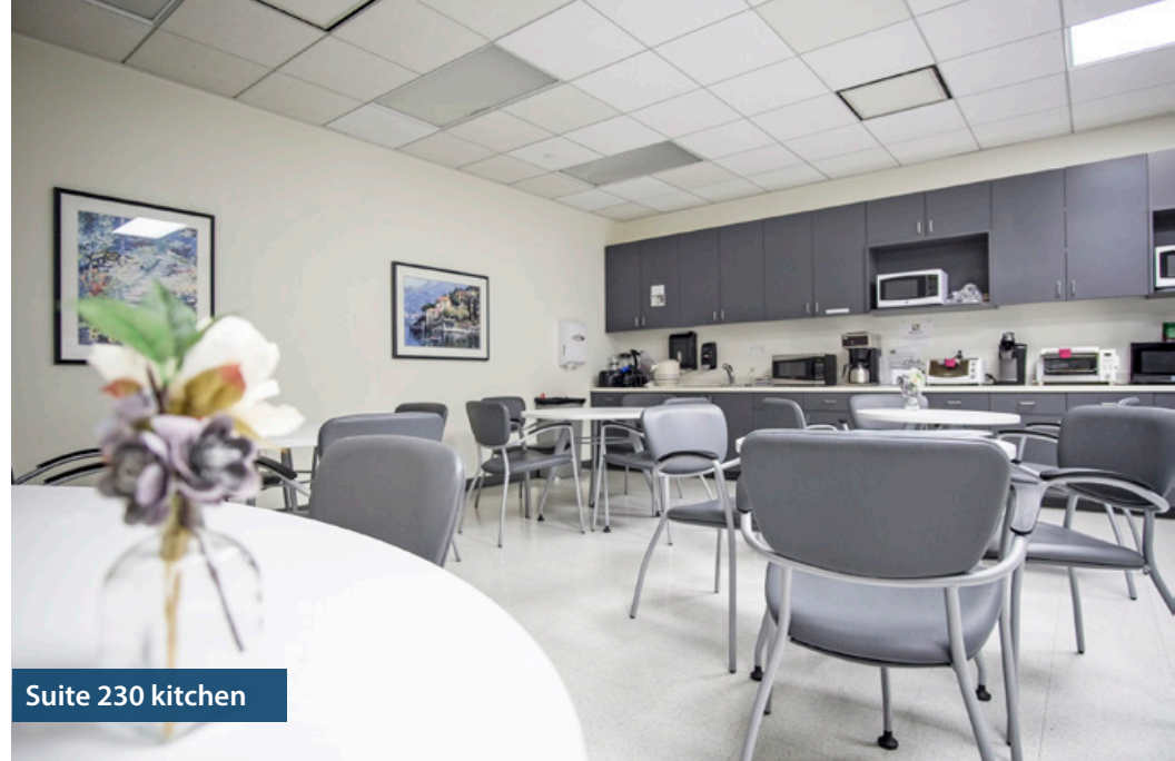
Suite 230 kitchen