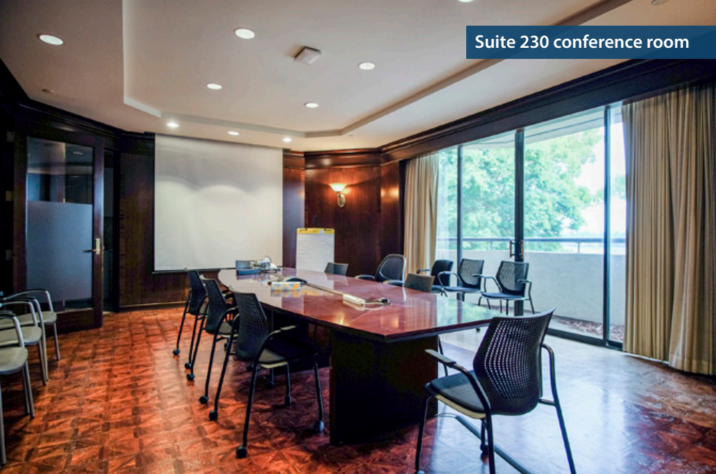
Suite 230 conference room