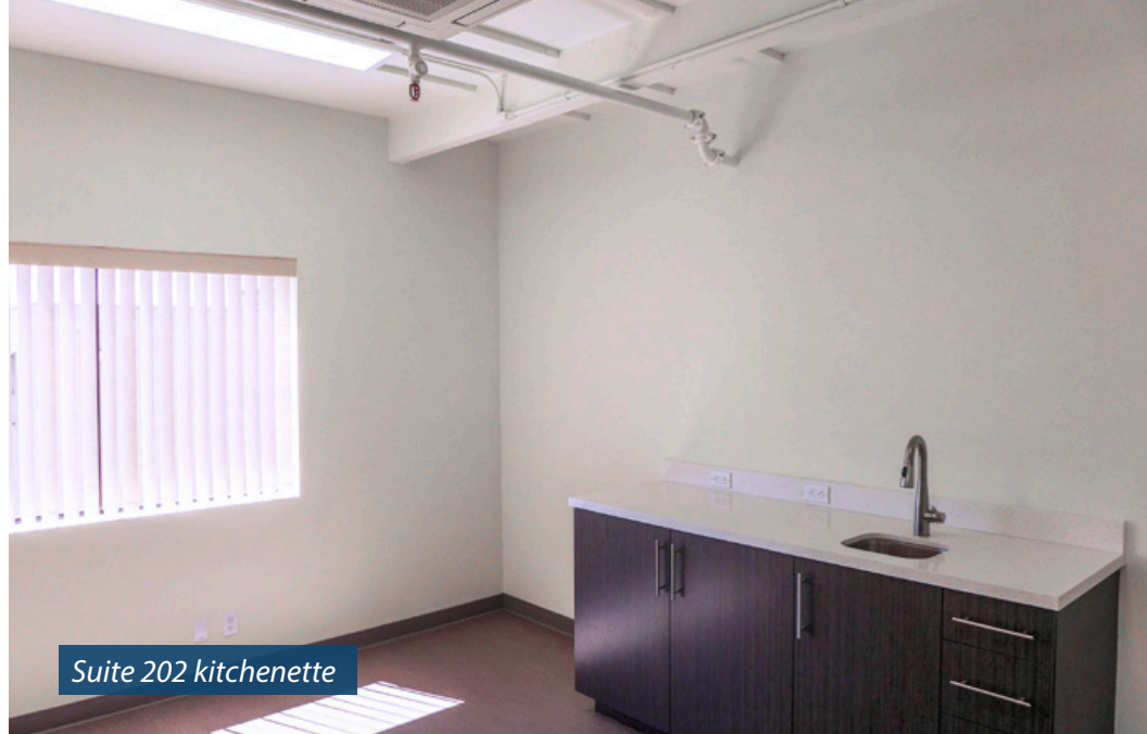
Suite 202 kitchenette