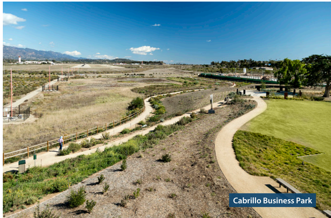
Cabrillo Business Park

Experience. Integrity. Trust. Since 1993