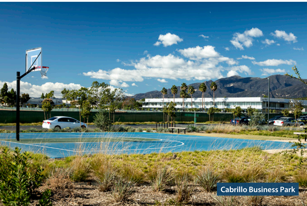
Cabrillo Business Park