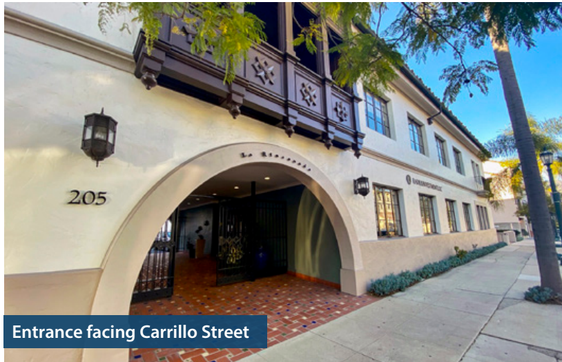
Entrance facing Carrillo Street