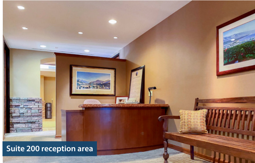
Suite 200 reception area