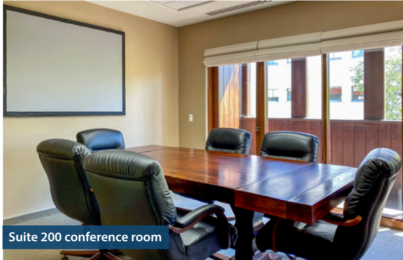
Suite 200 conference room

205 E Carrillo St, Santa Barbara | Class A, Second-Floor Office Suite | 3,920 SF