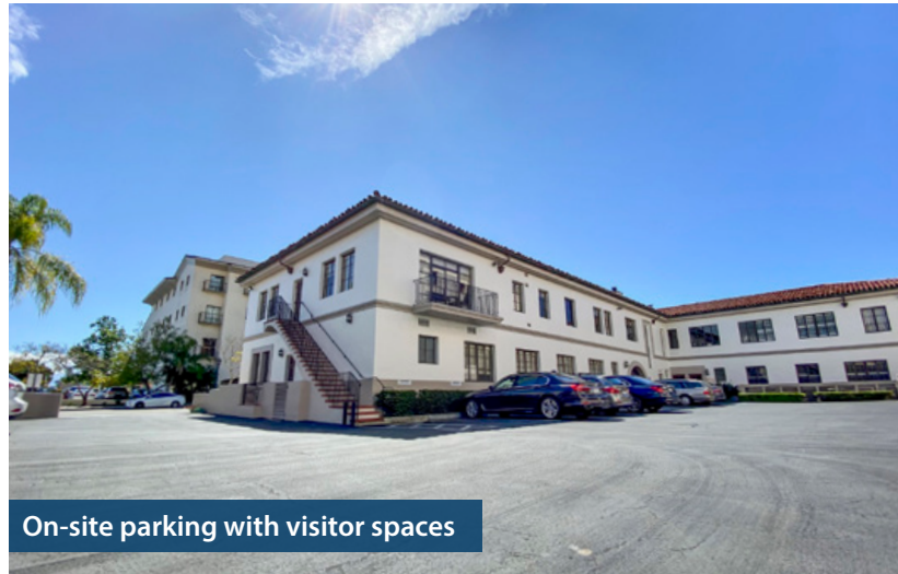
On-site parking with visitor spaces

Experience. Integrity. Trust. Since 1993