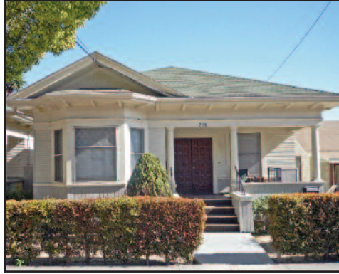
228 E Anapamu Street: SFR 3,100± SF building/3,485 SF land $795,000