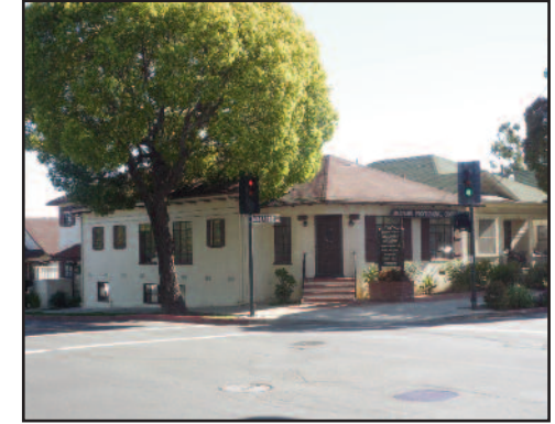
232 E Anapamu Street: Mixed-Use 3,640 SF building/3,485 SF land $1,195,000