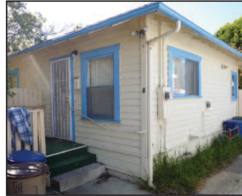
223 E Figueroa Street, #G: SFR 484 SF building/3,049 SF land $495,000