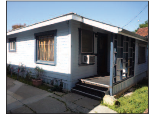
223 E Figueroa Street, #H: SFR 534 SF building/2,179 SF land $495,000