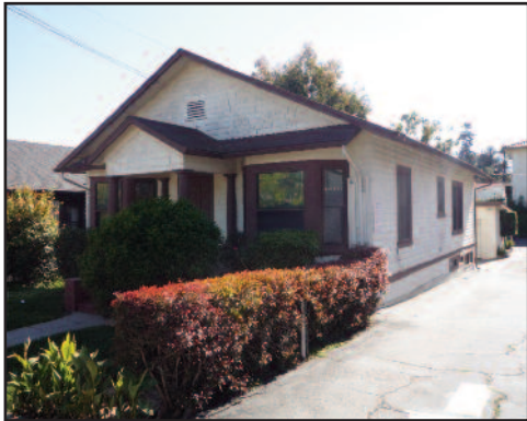
1121 Garden Street: SFR 2,300 SF building/4,410 SF land $795,000