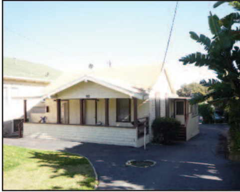
226 E Anapamu Street: Land 1,496 SF building/11,250 SF land $1,495,000