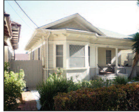
230 E Anapamu Street: SFR 2,544 SF building/11,250 SF land $795,000