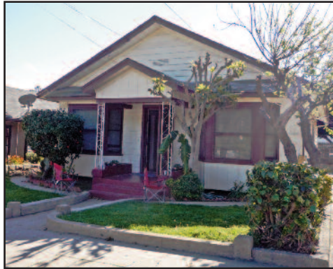
1117 Garden Street: Triplex 2,544 SF building/4,491 SF land $995,000