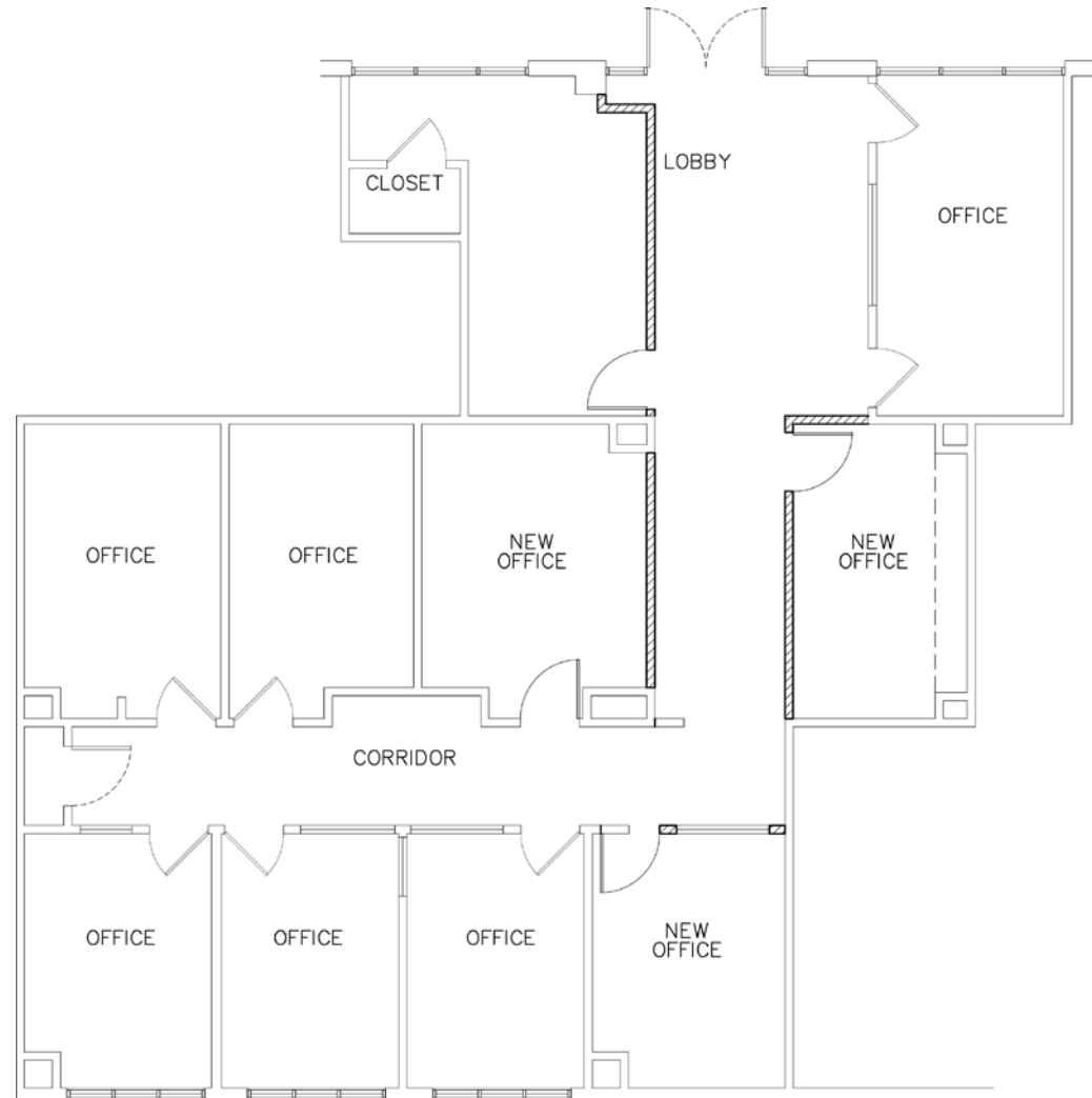
Conceptual floor plan - Suite 107

222 E. Carrillo St, Santa Barbara Downtown Office Space: 1,024 SF or 2,007 SF