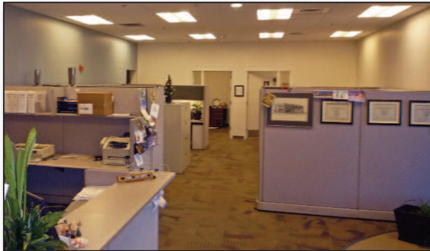
Open office area