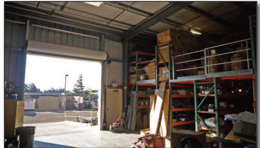
Warehouse with Mezzanine