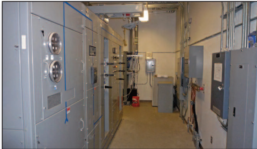
Electrical Room (2,000 Amp service)